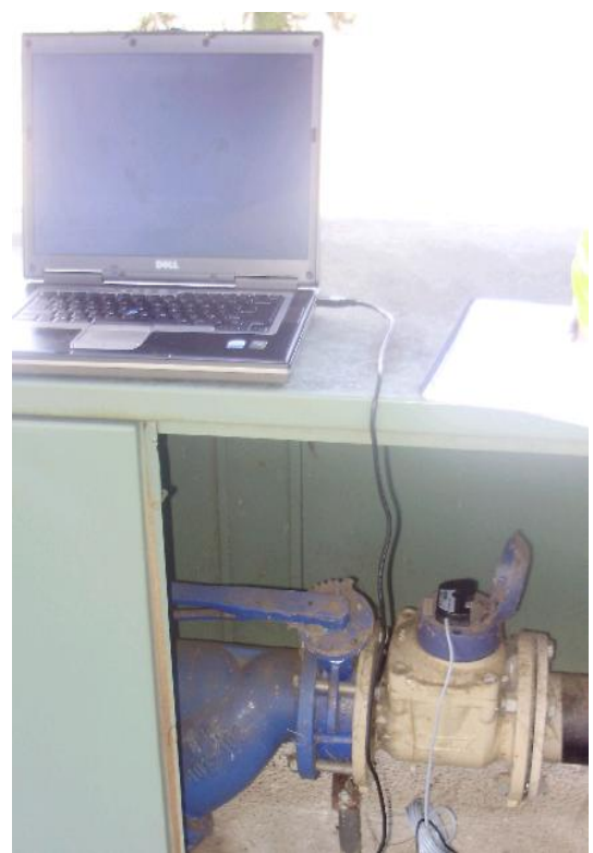
Data logger connected to water meter and laptop

A smart water meter is basically a conventional water meter linked to a data logger. The number of pulses captured is recorded with each pulse representing a specific volume of water, determined by the specification of your water meter(s). Telecommunications technologies make it possible to bring this signal to a computer, removing the need to manually read the meter and this is especially helpful if you are tracking multiple sub-meters on site. Generally readings are taken every 15 minutes, although this frequency can be altered depending on the consumer's requirements and available memory of the logging device. Records from the data logger can be downloaded over set periods of time and water consumption information can easily be graphed and analysed.