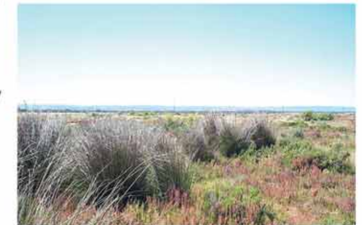
The regionally rare plant Gahnia filum (thatching grass), found at Bolivar

There are dozens of other remnant vegetation species on the Bolivar site including golden wattle, coast saltbush, marsh saltbush, berry saltbush, windmill grass, grassy bindweed, small flower wallaby grass, round-leaf pigface, woolly new Holland daisy and barren cane-grass.