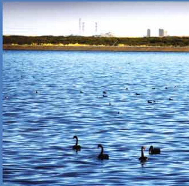
Some of the wildlife seen at Bolivar

Don't forget - to register a midge fly problem in your area, please call 8381 0300