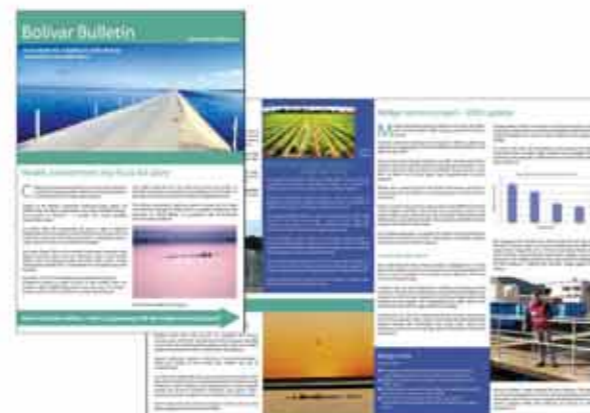
Bolivar Bulletin November 2005 Issue

We would like to thank those taking part in the program for their support. We'll keep you updated on the results.