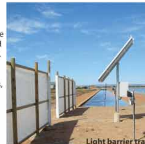
Light barrier trap

Light barrier trap: The trap consists of large white screens which are sprayed with the insecticide Bistar. At night, powerful lights shine on the screens to attract and kill the midges, preventing them from reaching the homes of nearby residents or returning to the lagoons to lay their eggs.