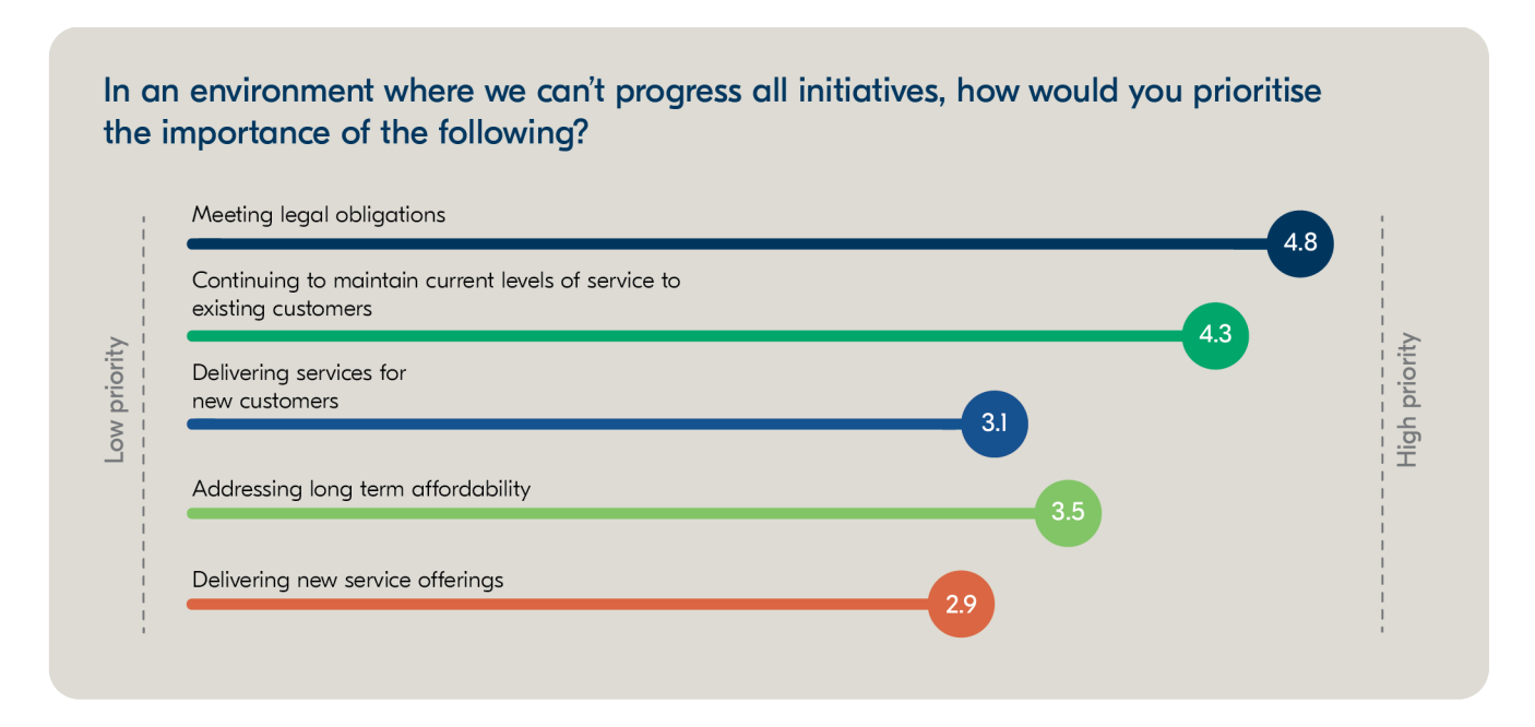
Figure 3 - CCG feedback of investment priority

For full details, see chapters 7, 8 and 9 of our Regulatory Business Plan 2024-28.