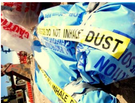
Photo 2: Double-wrapped asbestos material for temporary storage and disposal

When sections of these pipes are removed from the network, they are double-wrapped and temporarily held in designated storage bins on secure sites not accessible to the public, before being removed and disposed of by a licensed contractor at a licenced waste handling facility.